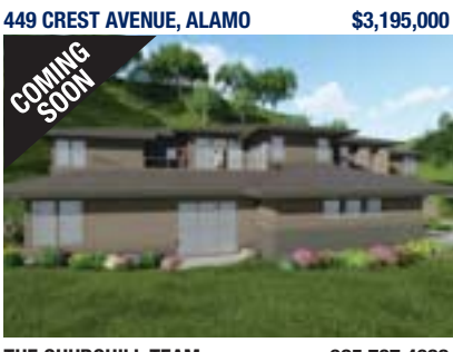
THE CHURCHILL TEAM