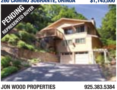
260 CAMINO SOBRANTE, ORINDA $1,145,000